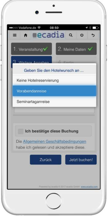
Participants indicate their hotel preference at the time of booking