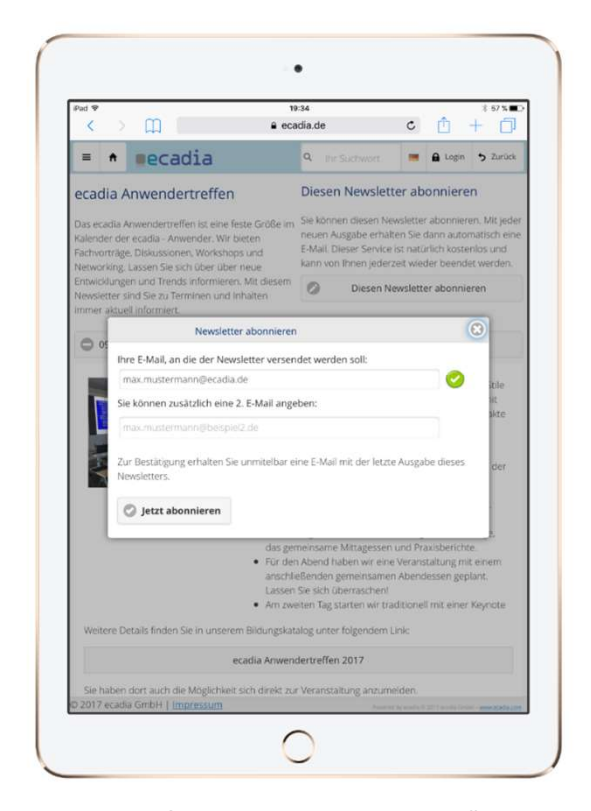
Input mask for "Subscribe to newsletter"

Subscribing to a newsletter is a one-click process. Subscribing to a newsletter is almost a click away. In addition, your customers can also provide a second e-mail address, for example, to receive your newsletter in their personal mail accounts.